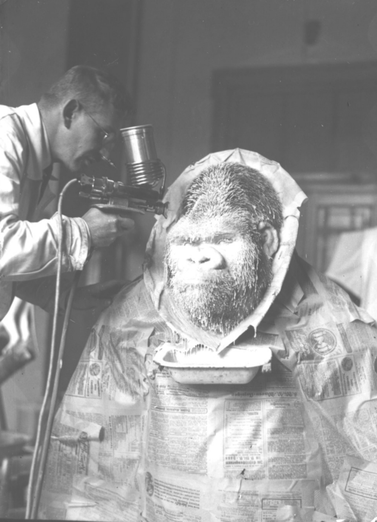
Image credits: above MfN HBSB Z.M. B III 1319; front Filippo Bertoni 2020. Poster design: Filippo Bertoni.

The Ringvorlesung draws from two current research clusters and their extended network: