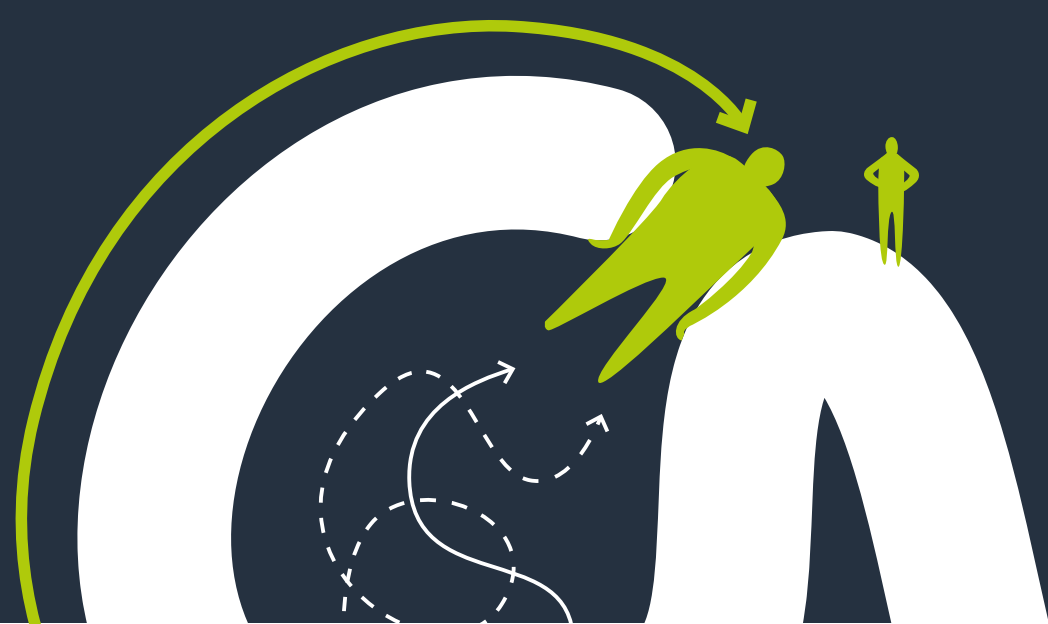
Slot 3 | Seeking Relevance